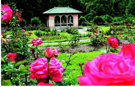
DAY 4: Our morning begins with a visit to Innisfree Garden , a powerful icon of mid-20th century design. Innisfree merges the essence of Modernist ideas with traditional Chinese and Japanese garden design principles in a form that evolved through subtle handling of the landscape and slow manipulation of its ecology. The result is a sublime composition of rock, water, wood, and sky achieved with remarkable economy and grace.